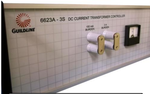
6623A-3S Front and Rear Views

The direct current transformer is designed with an open window to pass through a cable, set of cables, or buss bar that carry the current to be measured. The 6624CT-3000 DC Current Transformer produces an output current that varies directly with the input current in three ranges. By the connection of a reference shunt burden on one of the output terminals the current can also be calculated by measuring the voltage drop across the reference shunt. Note however that the direct current reading using the output current typically has much less uncertainty than using a reference shunt burden. All necessary interconnections for the control of a Guildline 6623A current source, the 6623A-3S Current Transformer Controller and the 6624CT-3000 Current Transformer unit are provided such that no hardware reconfiguration is required over the full range of operation other than the connection of the output current terminal to an appropriate reference burden.